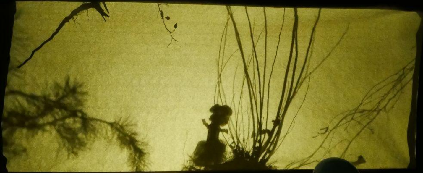
Shadowplay Of girls and stockings